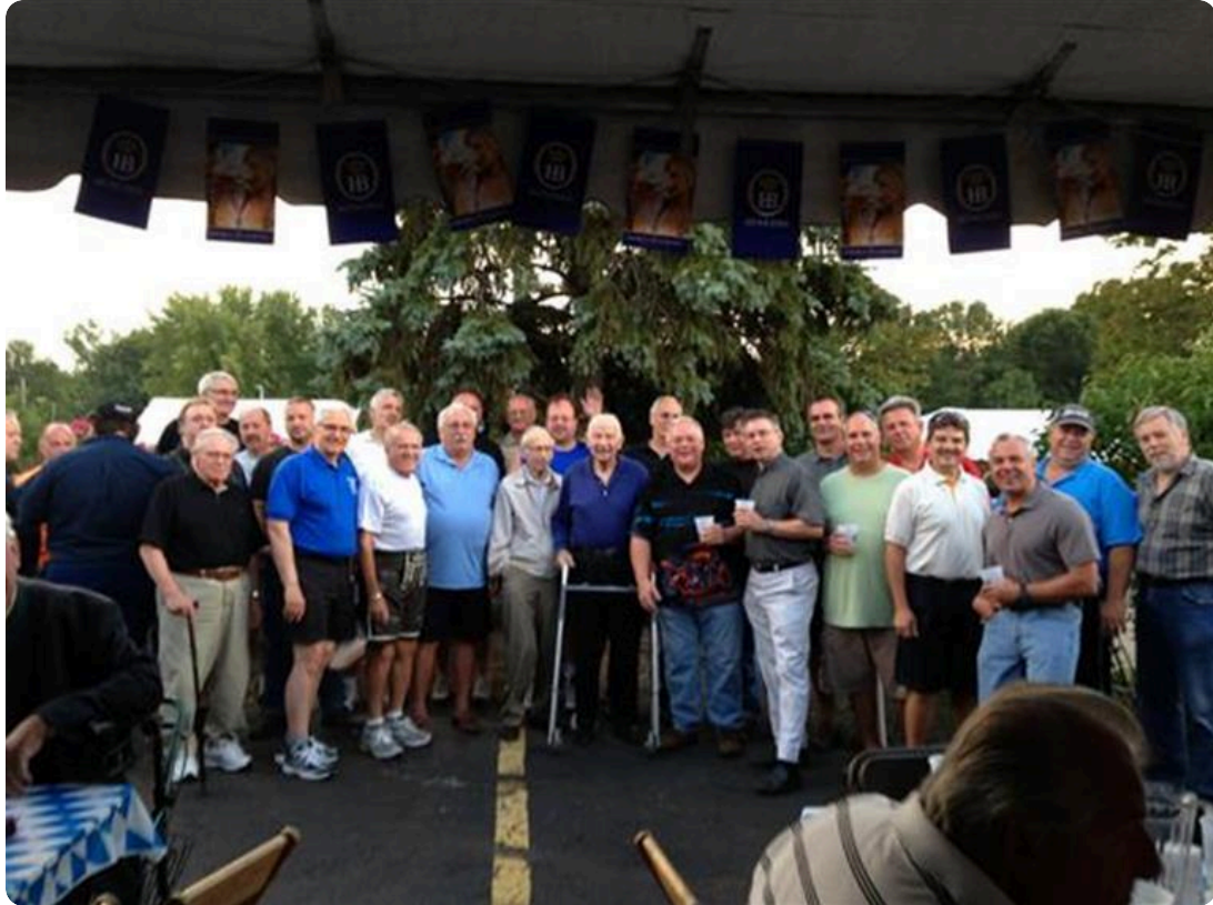
S&Z Boyz at a Reunion, 8-17-13